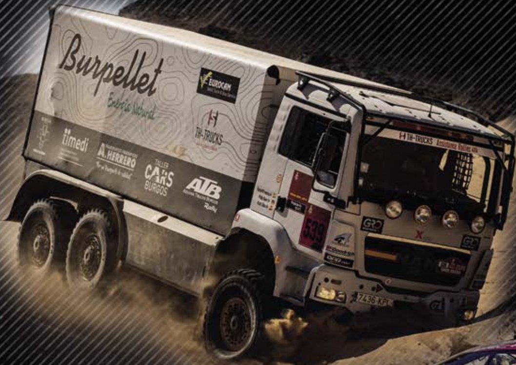
Rafa Tibau, 27 times participant in the Dakar Rally

GRD supplies lubricants and maintenance products to many top competition teams, to provide solutions to the highest demands of their vehicles.